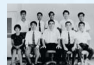
Established July, 1971