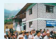
A High School in Nepal