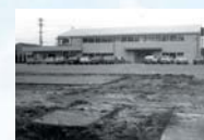
Construction of Hiroishi Plant