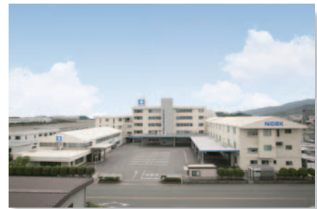
NIDEK Headquarters (JAPAN)