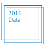
■ Domestic / Overseas Sales Ratio