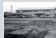
Construction of Hiroishi Plant