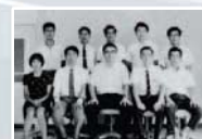
Established July, 1971