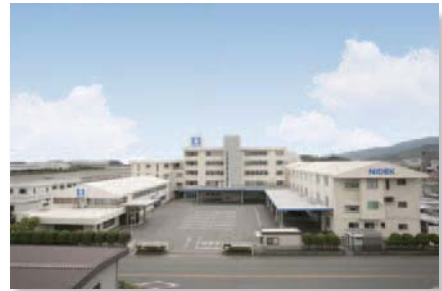
NIDEK Headquarters (JAPAN)