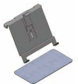
Tablet attachment for TS-610