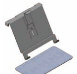
Tablet attachment for TS-610